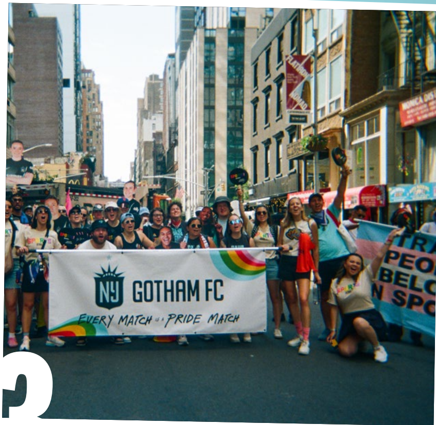
NYC PRIDE MARCH